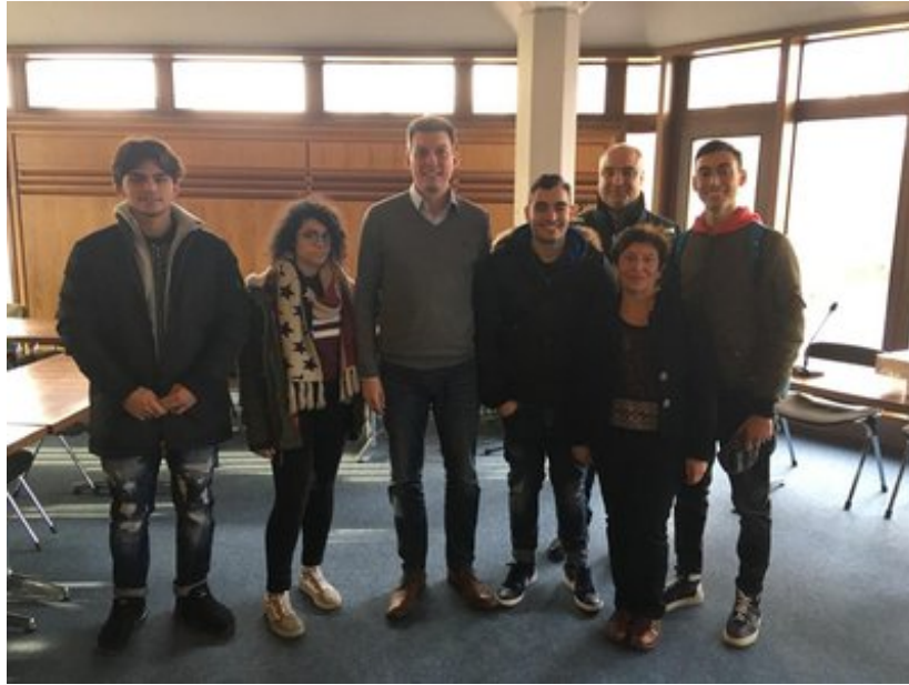
The Mayor of Dieburg