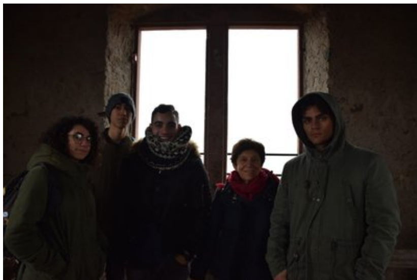
Day 3, Wednesday 28.11.2018