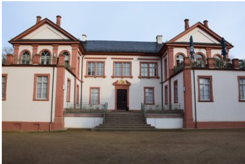
"Hohe Straße" in Dieburg assisted by UNESCO