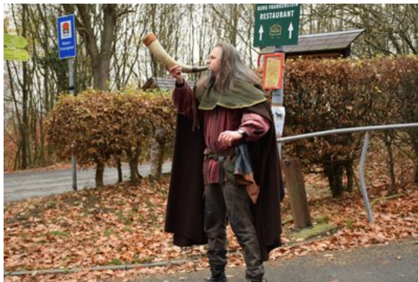
Visit to "Frankenstein burg"