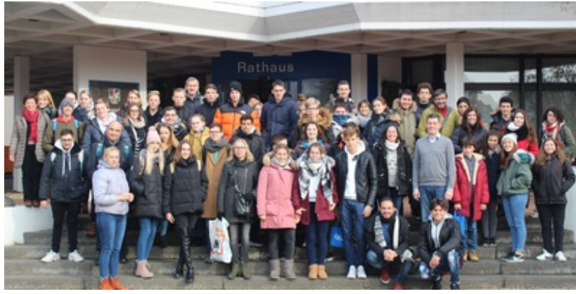
Dieburg city railye and meeting with the Mayor